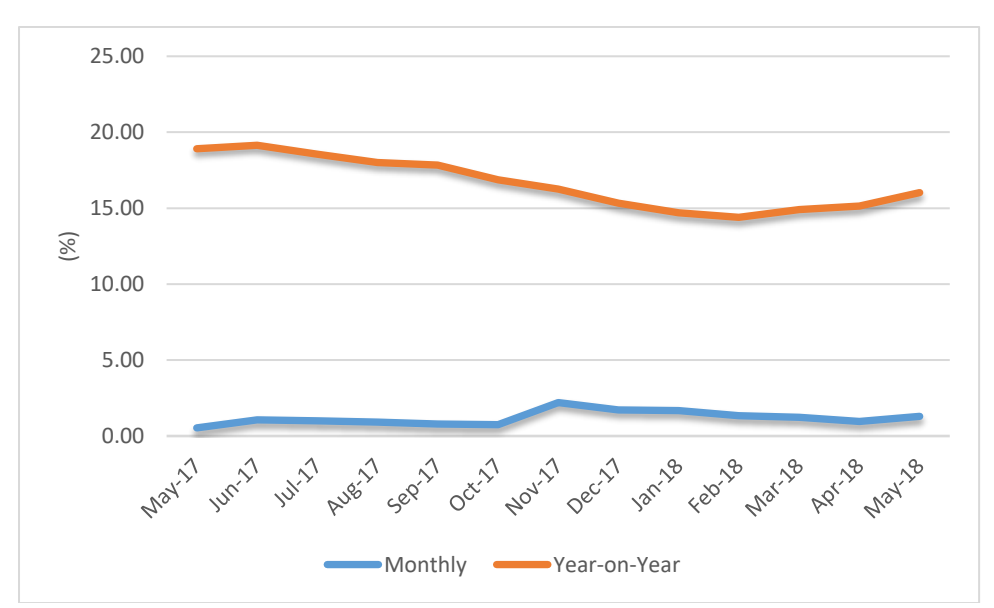
Figure 2: Headline Inflation-Y-o-Y and Monthly Inflation Change

On a month-on-month basis, consumer price inflation moderated to 1.31 per cent in May 2018 compared to 0.97 per cent in April 2018. Price development during the month was attributable to commodity shortages in the market due to election related uncertainties and the increased demand for food items during the month of Ramadan.